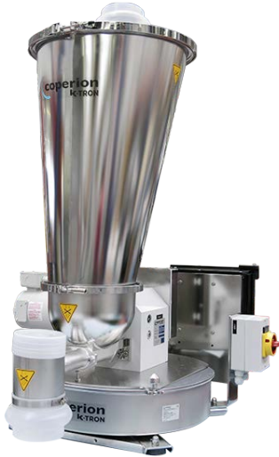
KT35 twin screw feeder on a D5 platform scale