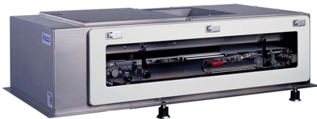
SWB-600-N Smart Weigh Belt Feeder with housing