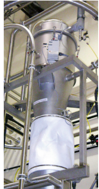
2400 Series Vacuum Sequencing Receiver