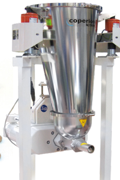
K-ML-S60 Single Screw Loss-in-Weight (LIW) Feeder