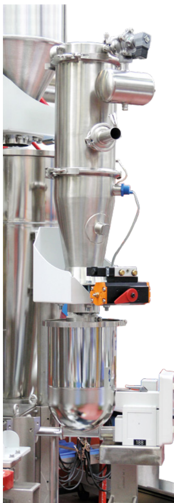
P10 vacuum sequencing receiver refilling a KT20 twin screw loss-in-weight feeder

A continuous vacuum system utilizes a continuous vacuum source and the use of a rotary airlock at the base of the receiver to keep the vacuum within the receiver while maintaining constant output. In a vacuum sequencing system the vacuum receiver is fitted with a discharge valve. When closed, the system transfers the material until a preset time or fill level is reached. Once