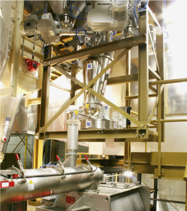
Loss-in-weight screw feeder feeding into a mixer

The production of fish food often requires both dry and wet ingredients