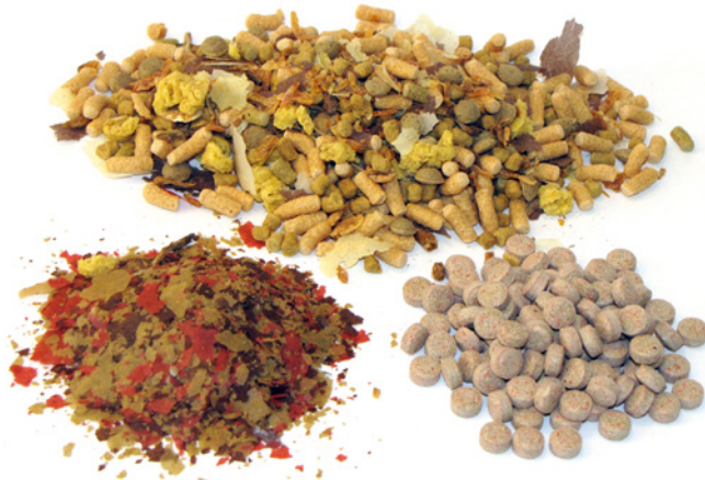
Fish food is manufactured in a variety of forms: flakes, pellets, clusters, etc.

Steam is introduced into the mixture in order to force the starch in the cereals to gelatinize. During the extrusion process a high pressure is built up in the product mixture and the temperature increases at the same time. When the product has passed through the extruder the pressure is lowered and part of the water is vaporized at the same time as the formed pellets expand, resulting in a porous structure which will absorb oil. By subsequently coating with oil, the fat content of the feed product may be increased to 20-30%. After extrusion, the water content is high, 20-30%, so the addition of oil is preceded by warm air drying which brings the water content of the finished product down to less than 10%.