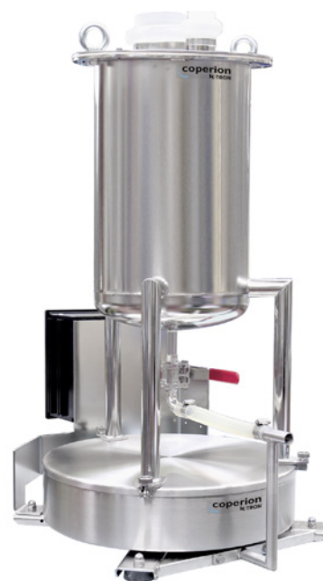
Liquid Loss-in-Weight (LLW) Feeder