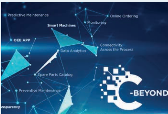
› OEE APP AS PART OF COPERION'S C-BEYOND DIGITAL SOLUTIONS

It includes performance, availability and quality parameters. On this basis, the App provides an extensive, automated evaluation and visualization of the corresponding operational data, leading to increased transparency in production whereby problems such as maintenance backlogs can be identified early. Downtimes are classified into categories to facilitate specific technical or organizational solutions.