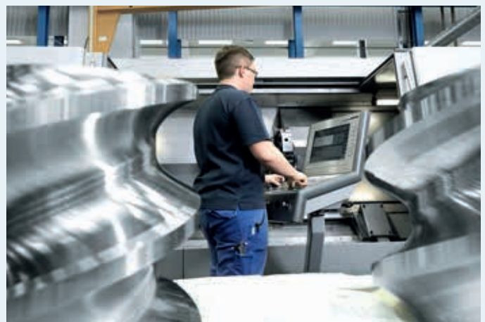
› SYSTEM RELIABILITY WITH HIGH QUALITY SPARE PARTS