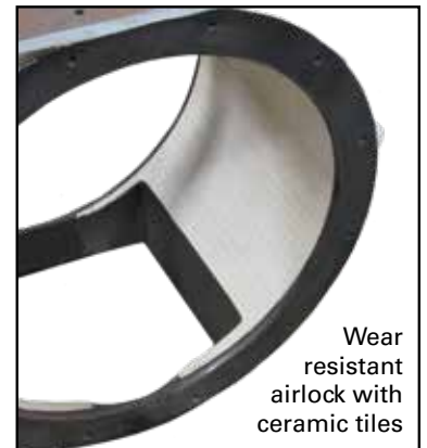
Wear resistant airlock with ceramic tiles